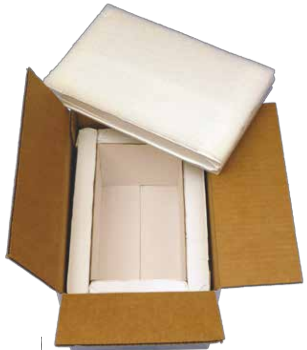
3.2L VIP Shipper product performance with 4.7 pounds of Dry Ice at a constant 30°C ambient temperature.